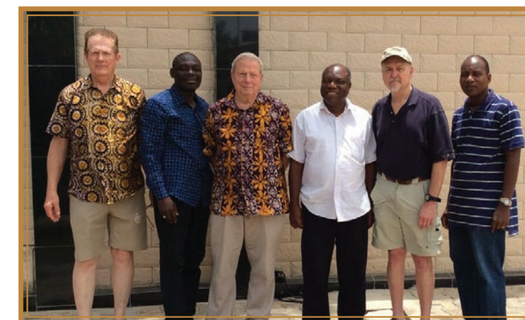
Microloan Team Leaders in Togo

Empowering church and community to be economically stable, spiritually transformed.