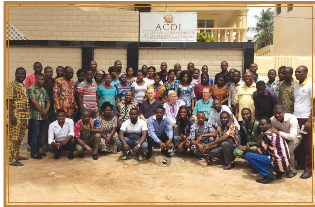
Small business seminar participants and Microloan candidates in Togo

There are over 50 Christian micro-entrepreneurs representing four regions where NHMI has convened in the city of Lomé, Togo for the seminar at NHMI/ACDI headquarter in Lomé. The response of the participants was overwhelmingly positive and the seminar was regarded by participants as one of the most important initial steps in empowering churches and communities for the spiritual growth and evangelistic outreach in West Africa. This seminar was taught by three retired American businessmen from Carriage lane Presbyterian Church, of Peachtree city, Safe Harbor Presbyterian church of Maryland and Crossroads Presbyterian church from Delaware. During the seminar, they covered various topics including: