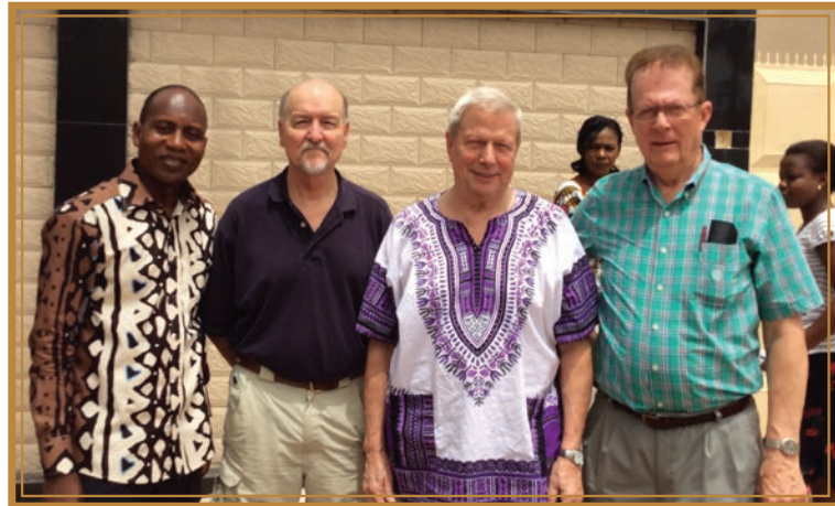
Microloan Partners & Trainers from U.S.

economic crises suffered over the past several years. Job opportunities are limited to the extent that parents often cannot support their families' needs. To find a stable job, people are migrating in large numbers to the capital city or other urban or suburban communities in order to obtain the financial resources to support their families more adequately. Those who remain in the villages also, of course, attempt to create means to earn a more adequate income. However, the reality is, that in both rural and urban areas, churches planted are often suffering from serious financial deficiencies. The monetary contributions given at Sunday worship services are minimal to sometimes nothing. Those who are fortunate to have jobs are often not able to support themselves adequately, much less be able to help meet the financial needs of a church planter or pastor. NHMI believes that one of the ways to help the